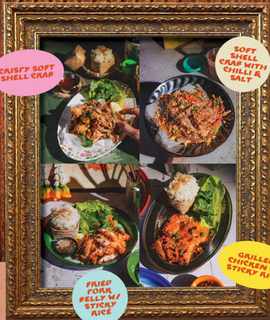
CRISPY SOFT SHELL CRAB