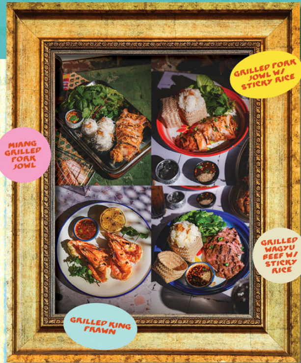
MIANG GRILLED PORK JOWL

GRILLED WAGYU BEEF W/ STICKY RICE ..... 31.9 Thai style grilled Wagyu beef with herb, served with steamed sticky rice and spicy tamarind dipping sauce.